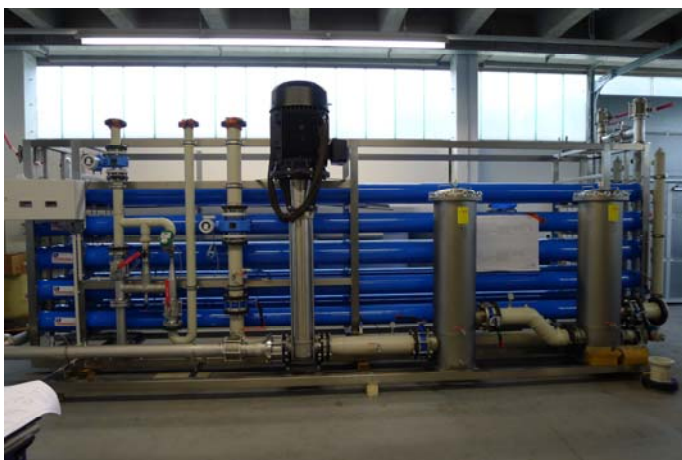
Reverse osmosis plant