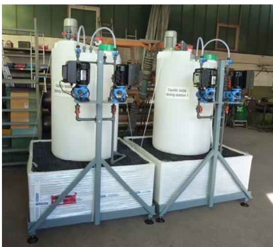
Dosing plant for caustic soda

Customer: Company for plant and machine engineering for the cement and mining industry Procedure: Reverse osmosis Capacity: 2 x 75 m 3 /h Year of realisation: 2013 Specialities: Fully automatic plant with reverse osmosis plant, dosing plant for antiscalant, sulfuric acid, sodium hypochlorite, caustic soda and corrosion inhibitor, UV disinfection, CO 2 trickle degasser and cleaning station for membrane element (CIP)