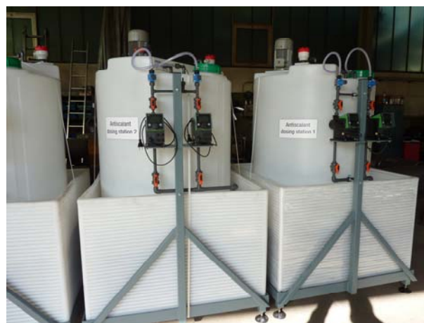
Dosing plant for antiscalant

Customer: Company for plant and machine engineering for the cement and mining industry Procedure: Reverse osmosis Capacity: 2 x 75 m 3 /h Year of realisation: 2013 Specialities: Fully automatic plant with reverse osmosis plant, dosing plant for antiscalant, sulfuric acid, sodium hypochlorite, caustic soda and corrosion inhibitor, UV disinfection, CO 2 trickle degasser and cleaning station for membrane element (CIP)